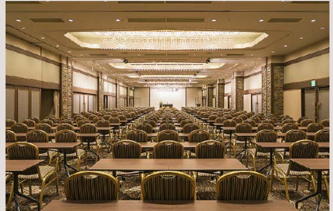
Convention hall "Tensyo"