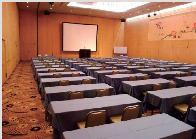
Royal Hall (1/3)