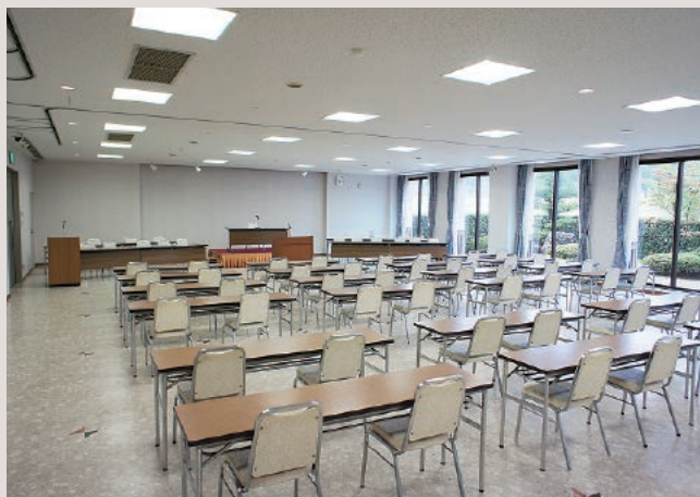
Meeting room "Shika"