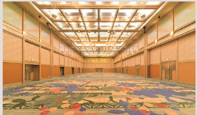
Festival hall "Ho-oh"