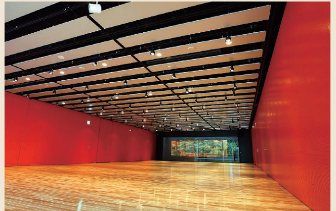
Hokkoku Shimbun Koryu Hall