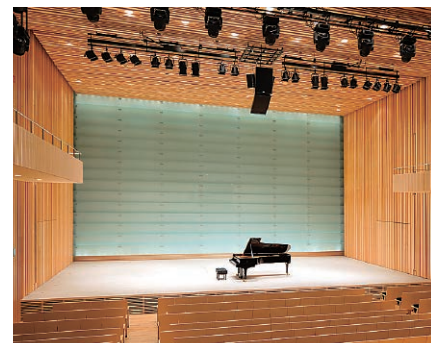
Akabane Hall (Shoe box style)