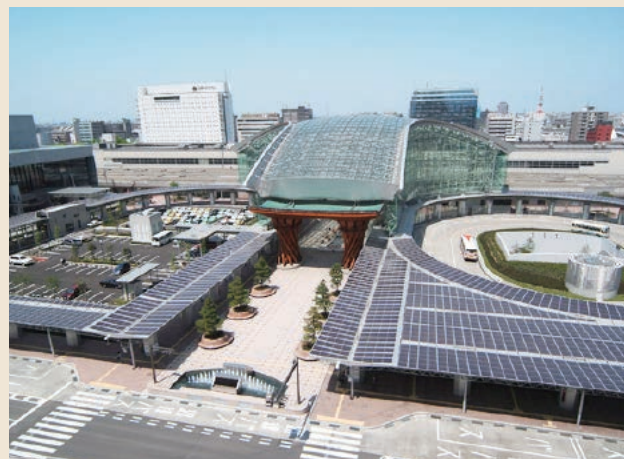
JR Kanazawa Motenashi Dome (above ground)

2 Kinoshinbo-machi, Kanazawa 920-0858 Kanazawa Station Event Area Operation Center TEL: 076-221-5952 FAX: 076-221-5952 URL: https://www4.city.kanazawa.lg.jp/kurashi_tetsuzuki/chokai_kyodo_shiminkatsudo/shiminkatsudo/10337.html