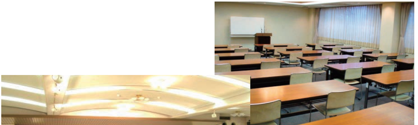
Workshop room 1