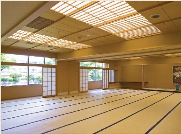
Meeting room 408, 409, 410 (Japanese-style rooms can be joined to form one large room.)