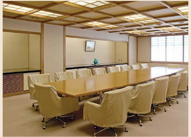
Meeting room 407