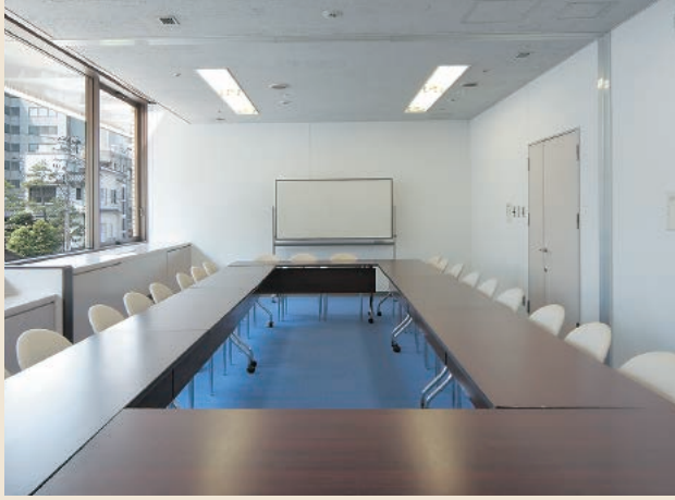
Meeting room 204