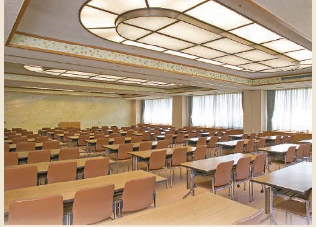
401 and 402 Meeting rooms (Large meeting room)