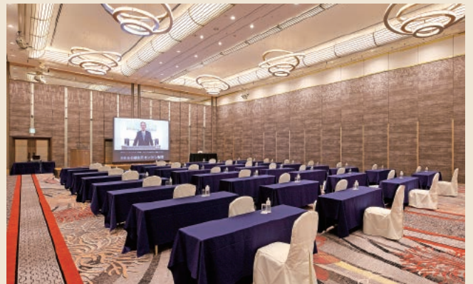
Large banquet hall "Tsuru-no-ma"