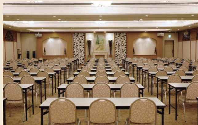
Meeting room 1