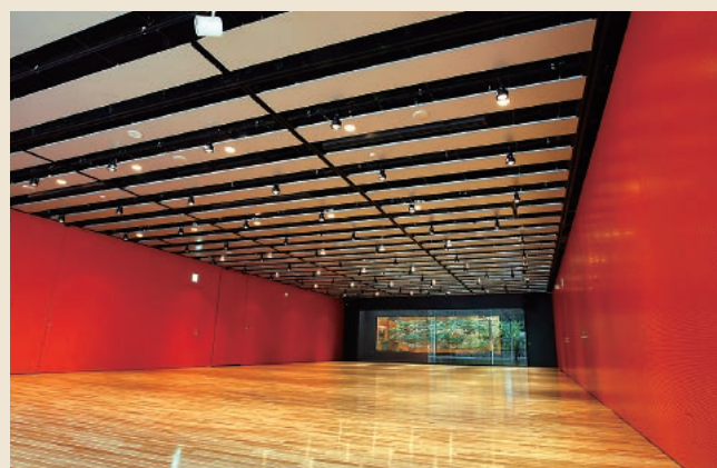
Hokkoku Shimbun Koryu Hall