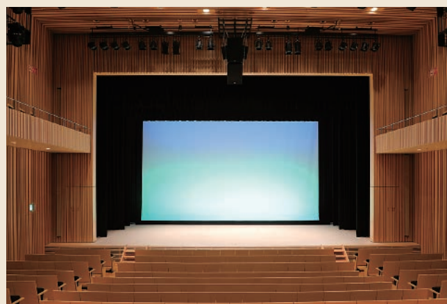
Akabane Hall auditorium(Proscenium style)