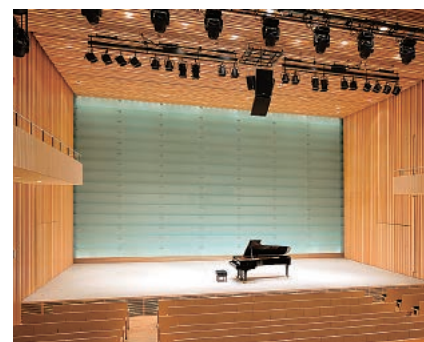
Akabane Hall (Shoe box style)