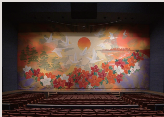
Large hall "Euphony Hall"