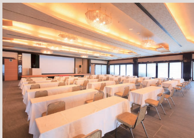
Convention hall "Sakura"