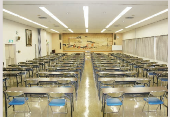
3FLarge hall(Large conference room)