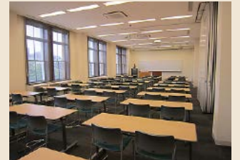
Seminar Room B