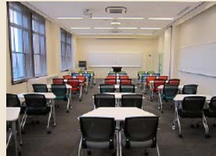
Seminar Room A