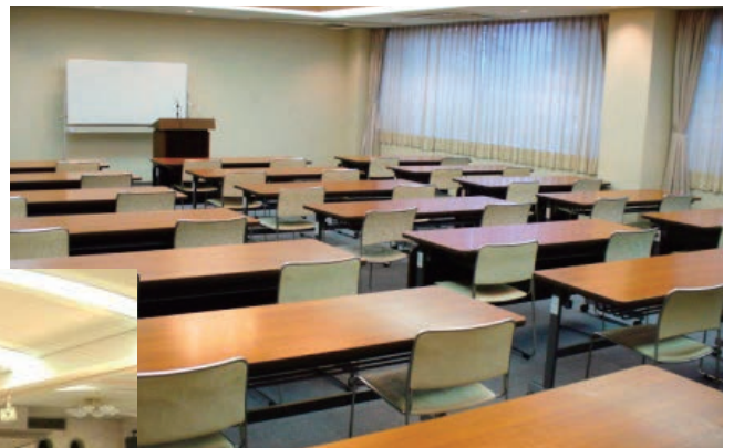
Workshop room 1