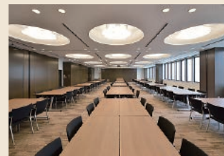
Large meeting room