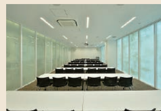
Workshop room 2