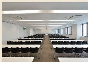
Workshop room 1